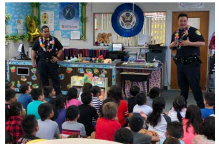
Gr. 1 with HPD Officers for “Say Hi” Visit

Thank you for supporting your child with time and accessibility to iReady reading and math at home. Thank you also for looking through your child's Take Home Folders and signing their planners daily. These practices help to support their progress, growth and independence.