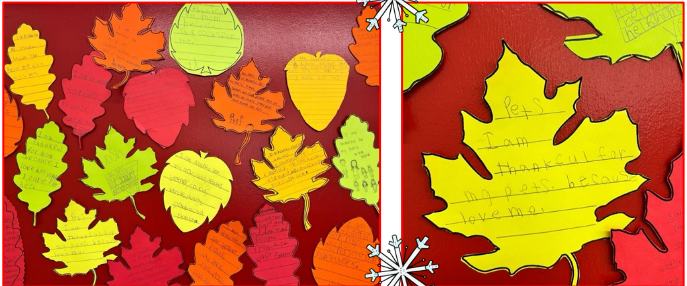
B7 Thankful Leaves