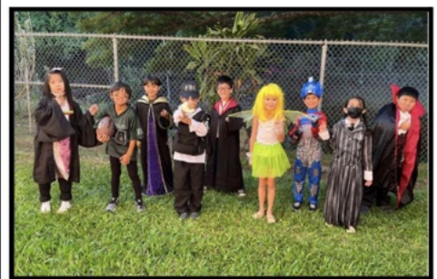
Spirit Week Costume Dress Ups