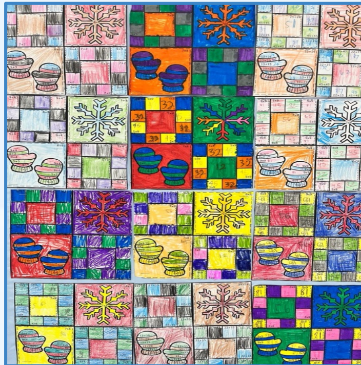
B7 Winter Multiplication Quilt