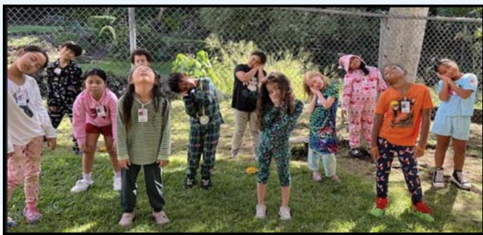
Long Winter Nap

for all of your hard work and dedication in helping our second graders learn the dance moves and practice for our Winter Song Fest!