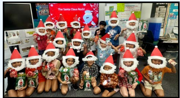
Winter Song Fest