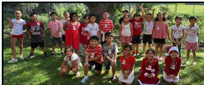
Candy Cane Day