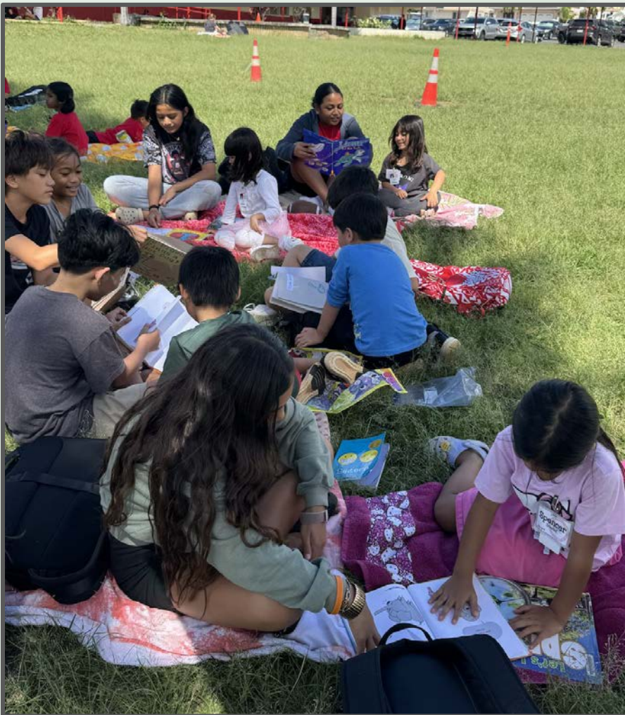
We swapped screens for green as we kicked off Read Across America Week with Reading on the Lawn! Special shoutout to our Grade 5 Buddies for reading aloud to our kinders!