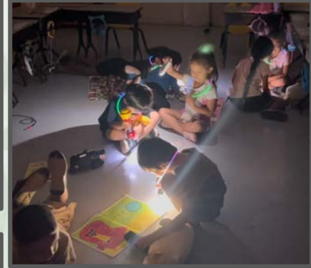
What a super BRIGHT experience as we shined a light on reading!